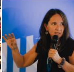
The future we would rather have