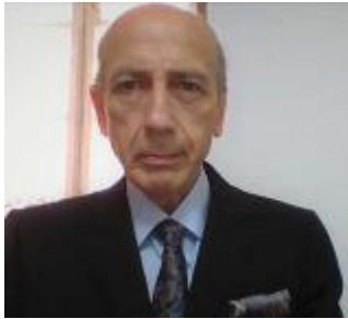
She is no more