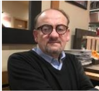
Now we have the proof: The islands