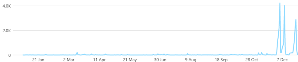
Table 1: showing an increase in Facebook reach by 62% in 2022