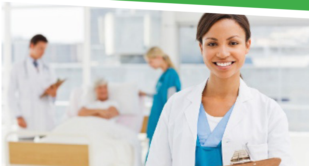
2. The source of the text with the green background is: "Seeking healthcare in another EU Member State: your rights", published by the European Commission